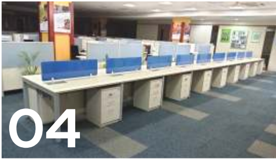
OPEN DESK SYSTEM