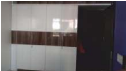
WARDROBES & LOFTS