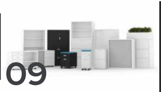
LOCKER & STORAGES